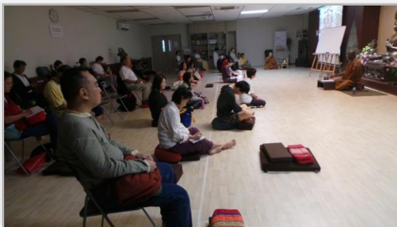
Bhante in Singapore Once Again pg.4