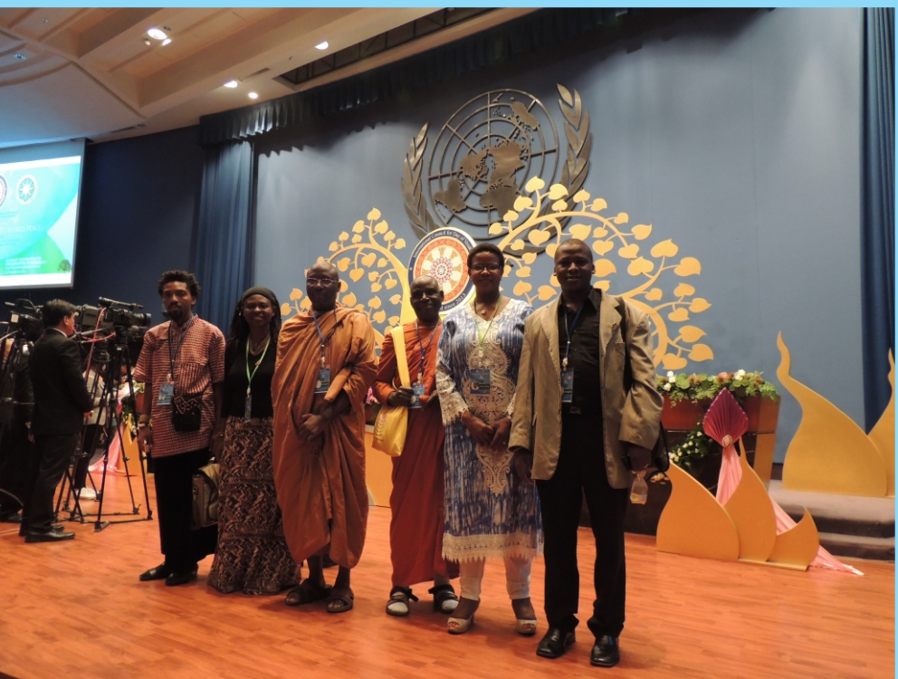
Members of African Buddhist Union at the United Nations Vesak Day Celebration in Thailand.

Vesak Day is an important day on the Buddhist calendar. Vesak (the month of May) is the month in which the birth, enlightenment and final passing away of Gautama the Buddha occurred. Now, Vesak Day is a holiday, officially recognized by the United Nations (UN), on which Buddhists throughout the globe come together in peace and harmony to commemorate the three events in the life of the Buddha. On this date, celebrated every year, Buddhists recall the knowledge and wisdom which arose in the Buddha on the night of his enlightenment and work towards developing the same wisdom.