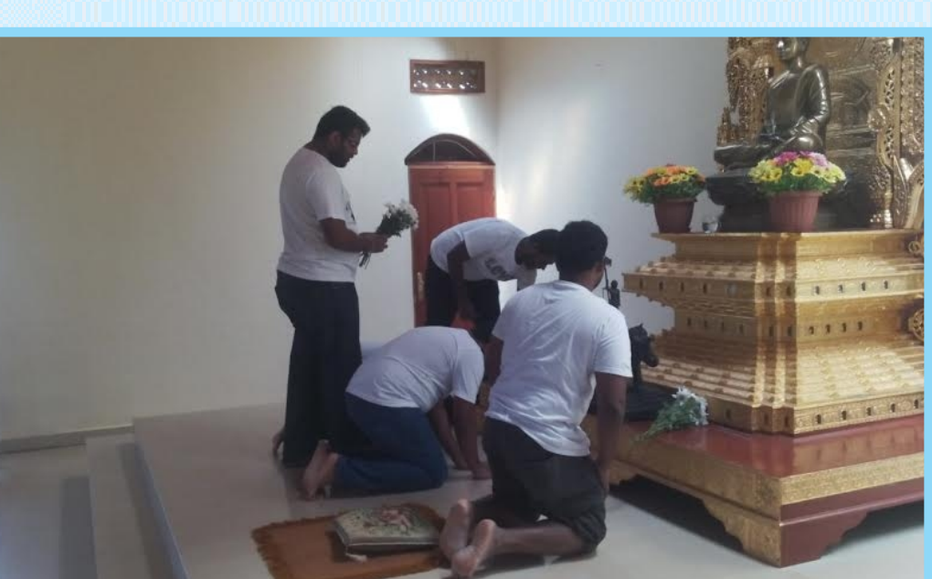
Sri Lankans offering flowers at the Temple on the Vesak Day.