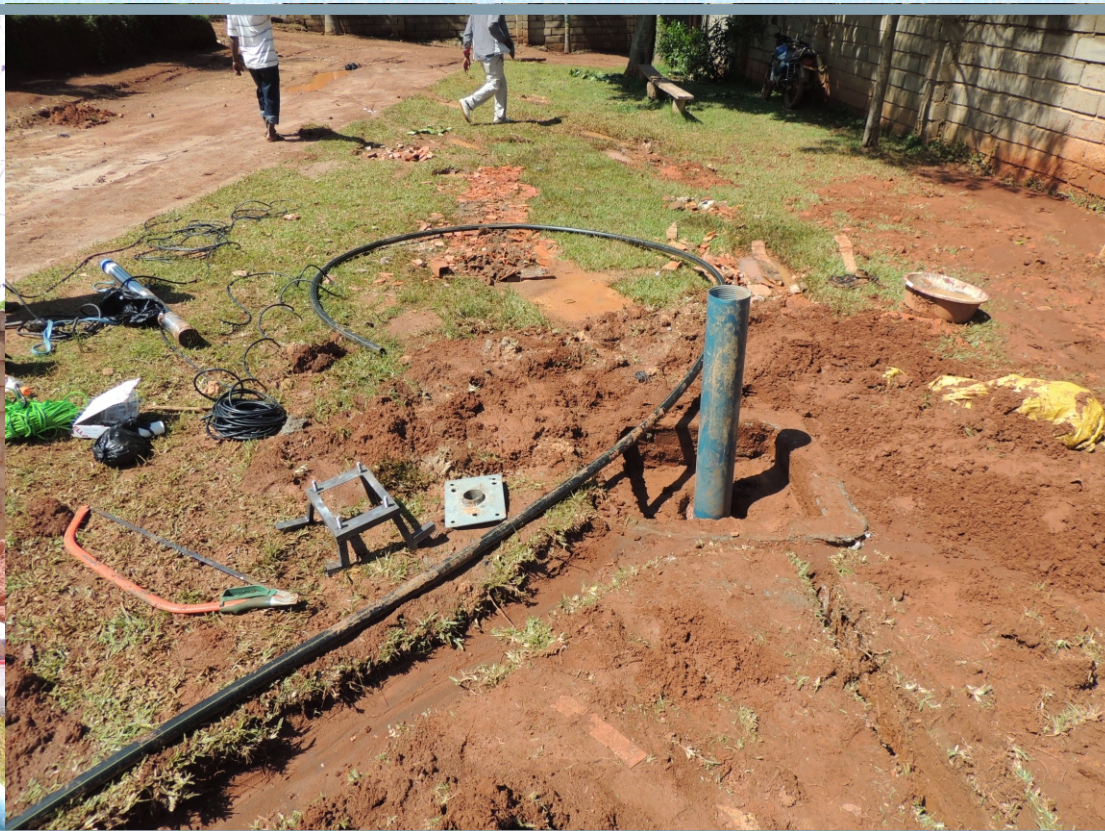
The drilled Pump operated borehole. It is not yet finished. However, our thanks goes to the Buddhist friends from Melbourne, Australia for their kind donations.