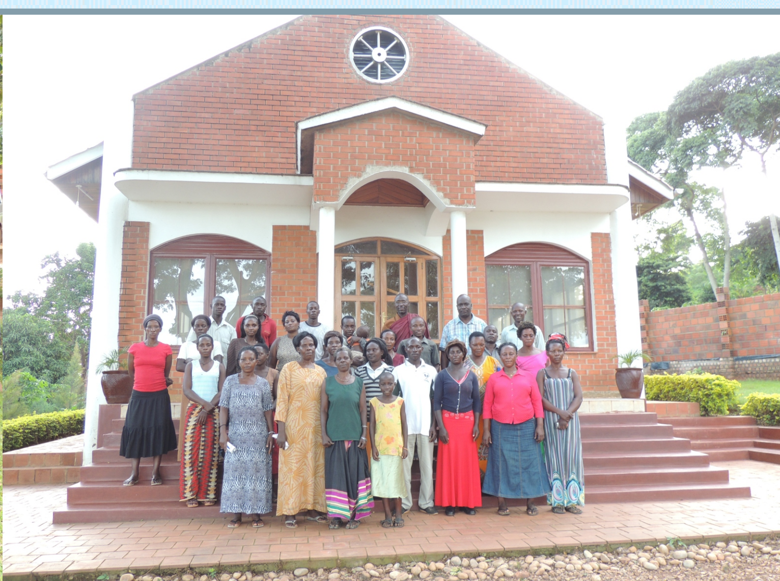
Members of Uganda Buddhist Community at the Uganda Buddhist Centre

Previous projects were discussed e.g. envelope making by the