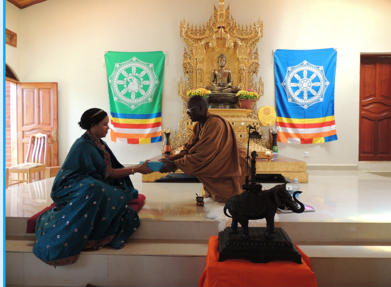
Venerable Buddharakkhita offering a gift to H.R.H Queen Mother Best Kemigisa of Tooro Kingdom at the celebration of the International Buddhist Day.