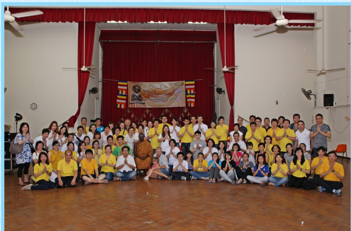
Participants of the Vesak Day celebrations at Buddhist Fellowship of Singapore.