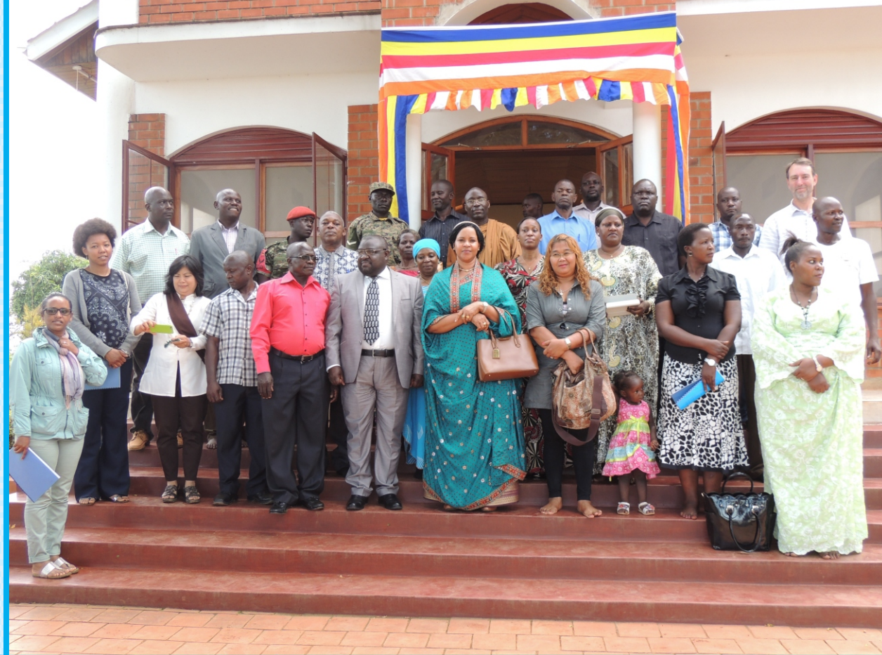
Participants of the International Buddhist Day Celebrations posing for a photo.