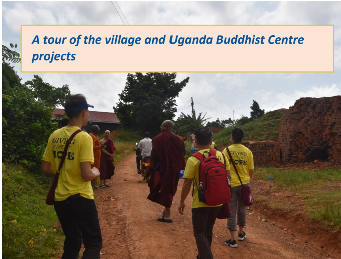
A tour of the village and Uganda Buddhist Centre projects