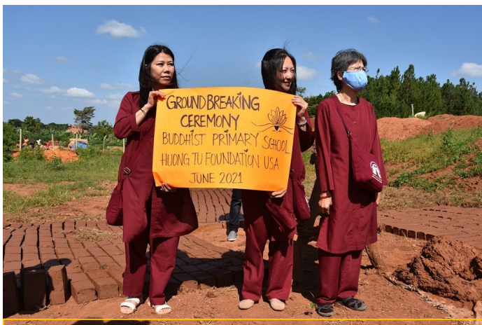
Visitors at the ground-breaking ceremony of the construction of the Buddhist Primary School