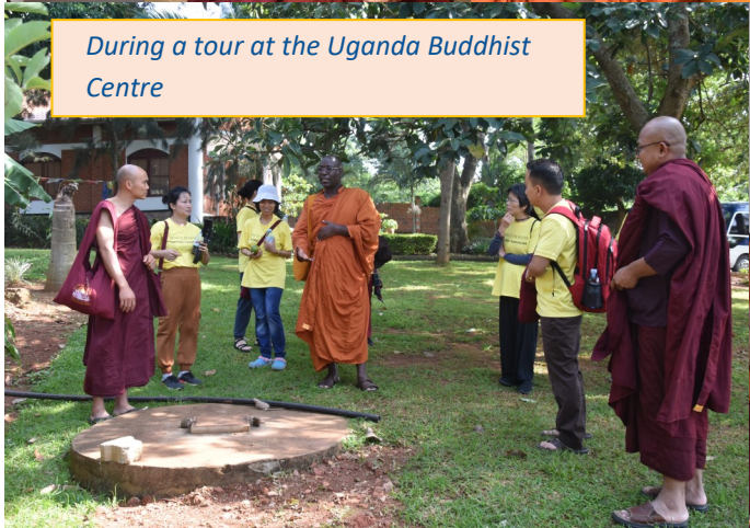
During a tour at the Uganda Buddhist Centre