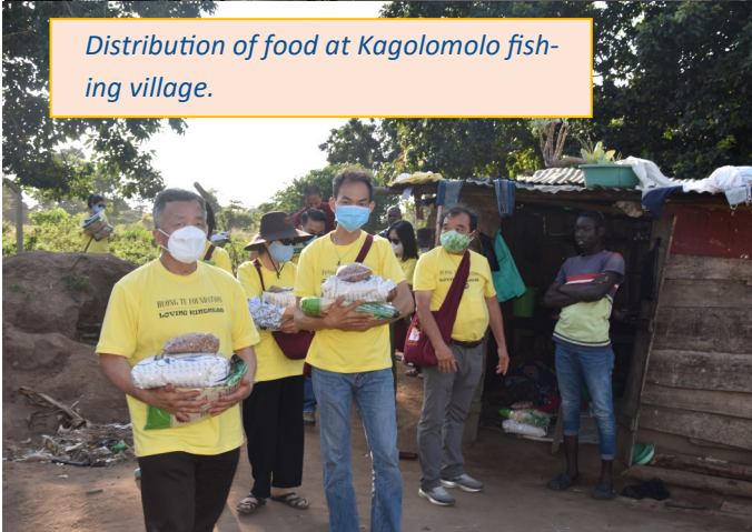
Distribution of food at Kagolomolo fishing village.