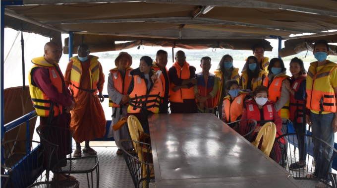
Boat cruise to the Source of River Nile and on Lake Victoria in Jina.