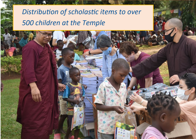
Distribution of scholastic items to over 500 children at the Temple