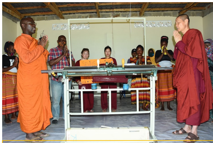
Official offering sewing machines to the Women Empowerment Project and blessings led by Venerable Ratanaguna Venerable and Buddharakkhita