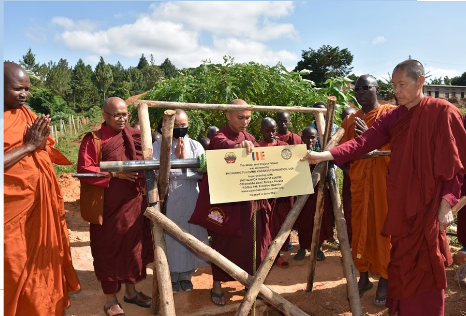
Visitors inspecting the a borehole hand-digging process at the Buddhist Primary School

The group had planned to stay in Uganda for a period of 20 days. However, following the Presidential directives and a lockdown in efforts to contain the spread of COVID-19, their visit was cut short, and so they had to leave back to the Texas on June 9th. On this day, a grand ground-breaking ceremony of the first Buddhist primary school in Uganda was conducted, and the official launch of