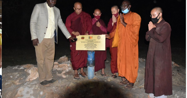
Soft opening and blessing of a borehole donated in Gwase, Buyende District.