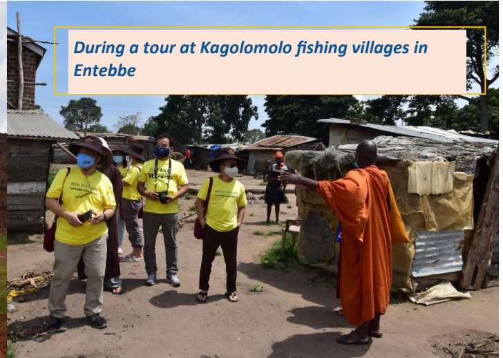
During a tour at Kagolomolo fishing villages in Entebbe