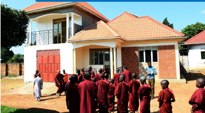
The two properties bought for the Compassion Orphanage for boys and girls