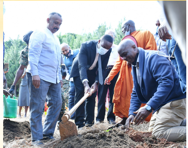
The King planting a tree at the Uganda Buddhist Centre marking his first visit to the Temple.