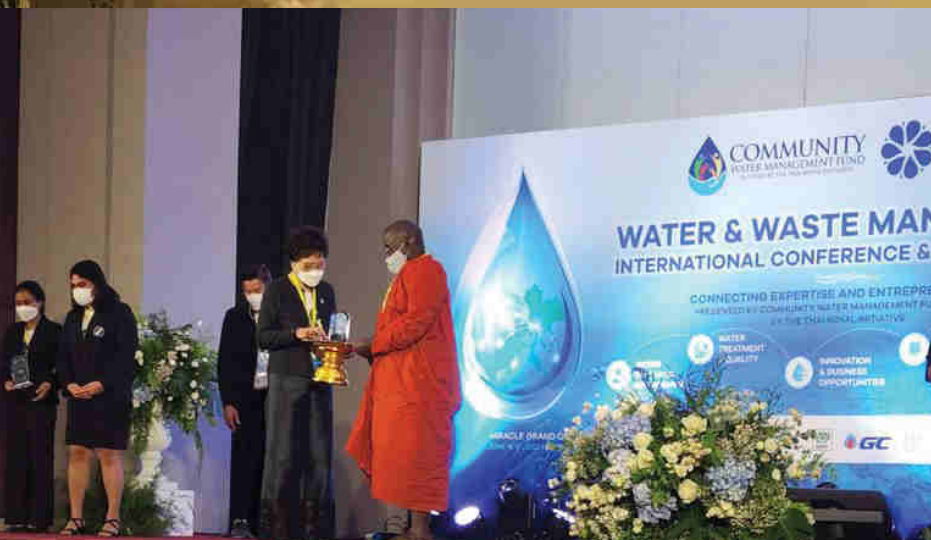
Bhante Receiving a memento from Hon. Kalaya Sophonpanich, the Deputy Minister of Education in Thailand