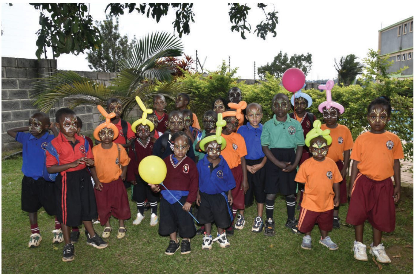
BUDDHIST PEACE SCHOOL NURSERY SECTION ON A SCHOOL TOUR