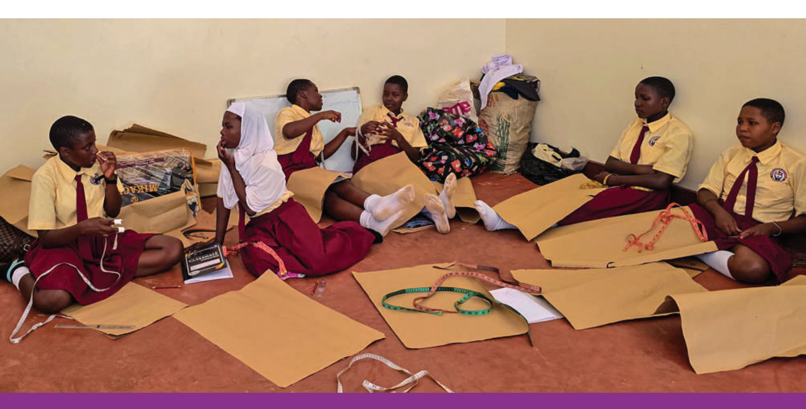
BUDDHIST HIGH SCHOOL STUDENTS DURING THEIR DIT TRAINING

For contributions or further engagement, please contact the Uganda Buddhist Centre. Your support will help shape the future of women and young learners, creating a pathway to economic independence.