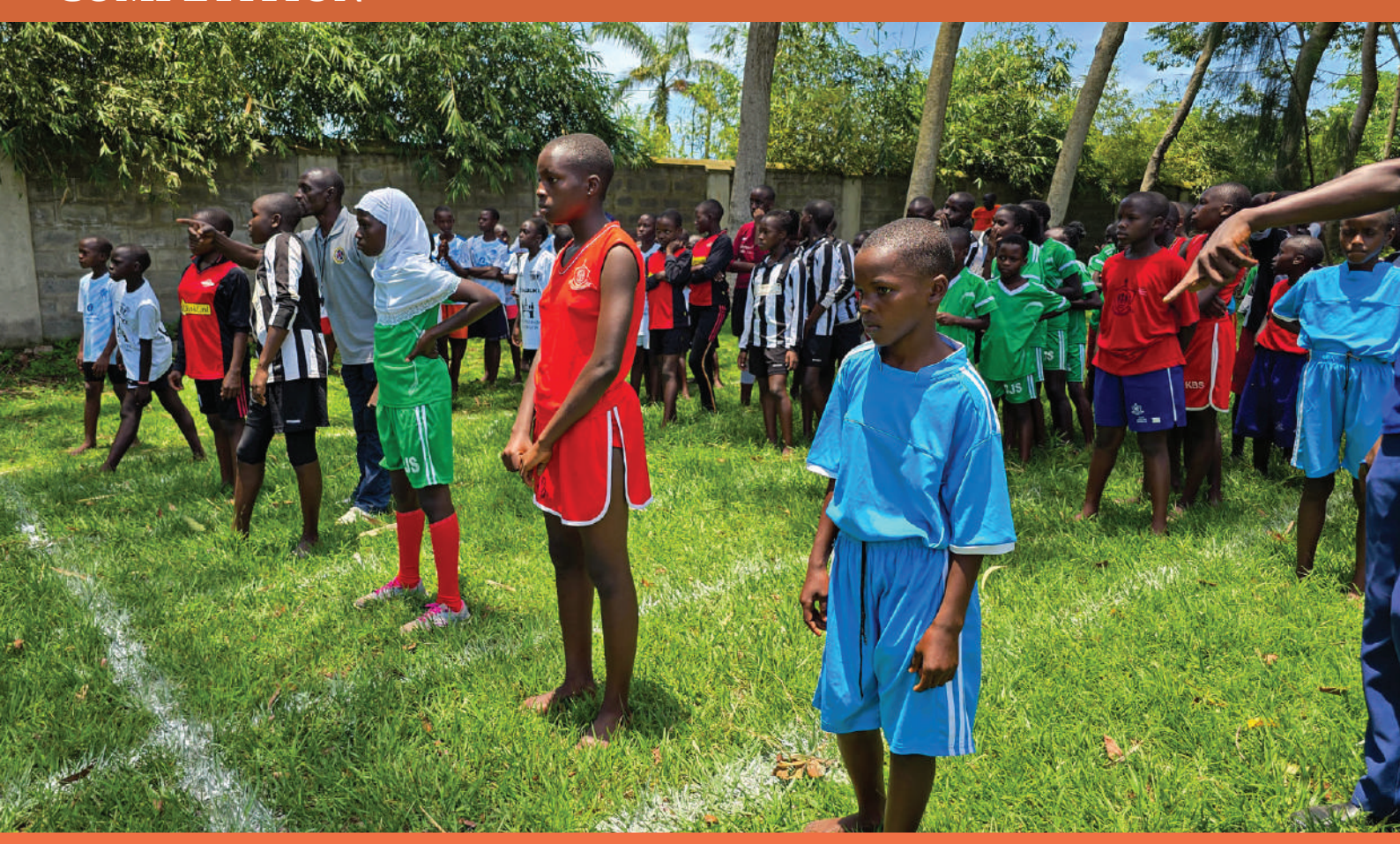
BUDDHIST PEACE SCHOOL STUDENTS DURING THEIR ATHLETIC COMPETITION